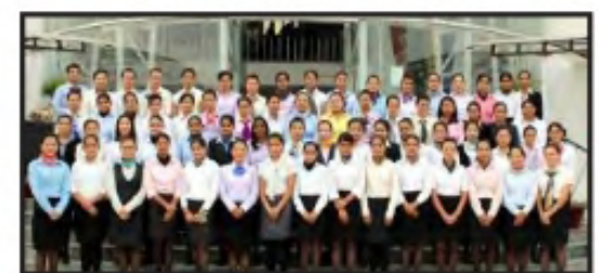
Personified Personality ready to join Industry with Life Management Skills