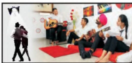
Joyful Learning with Media Entertainment