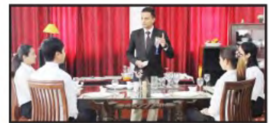
Dinning & Social Etiquette Interpersonal Skills