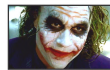
Actor in You