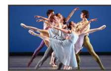
Dance & Aerobics