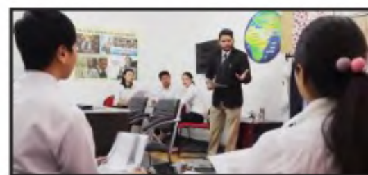
Sales & Marketing Skills