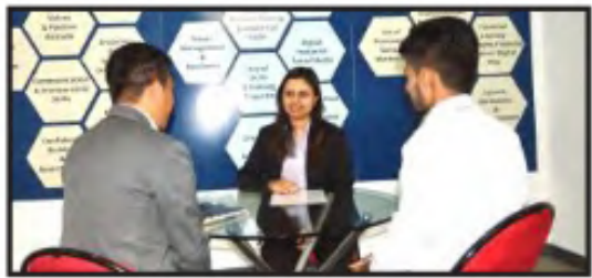
Psychometric Test Cum Counseling Session