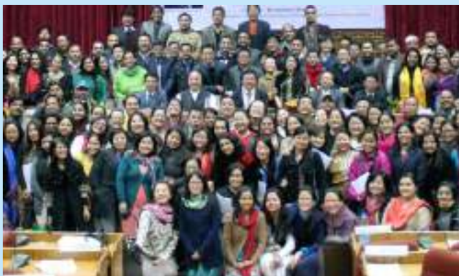
TEACHERS EMPOWERMENT PROGRAM, SIKKIM

ICSI conducts 5 days Empowerment Training Program for Teachers, Trainers and Counsellors duly approved by NCERT, Ministry of HRD, Govt. of India