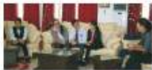
Life Management Skills Lab