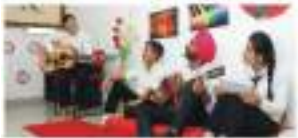
Music, Health & Yoga Therapy Lab