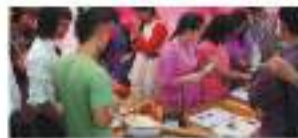
MSME & Technical Skills Lab