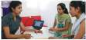
Aptitude cum Psychometric Test