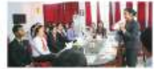
Dinning & Social Esiquette Interpersonal Skills Lab