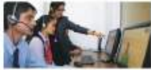
English Language Lab (Aptitude-English-Career)