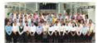
Personified Personality ready to join Industry