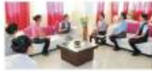
Soft Skill Lab