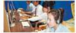
Basic ICT Lab