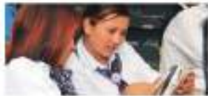
Creative & Logical Thinking Lab