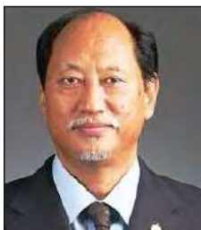
Sh. Neiphu Rio Hon'ble Chief Minister Nagaland