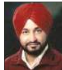
S. Charanjit Singh Channi Hon'ble Minister Emp. Gen. & Training, Govt. of Punjab