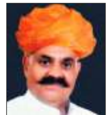
H.E V P Singh Badnore Hon'ble Governor Punjab & Administrator U.T. Chandigarh