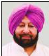
Capt. Amarinder Singh Hon'ble Chief Minister Punjab