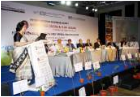
International Business Summit Herbal Health Tourism, North East (India) CLMV (ASEAN) Director, Min. of Commerce, Govt, 24-25 March 2017, Guwahati