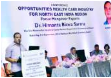
Conference, Medical Tourism-North East Region, Health Minister, Assam 3rd Sept. 2016, Guwahati