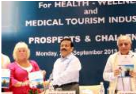
International Conference SKILLING INDIA for Health & Wellness Ind. Additional Secy. Min of Tourism, Govt 23rd Sept. 2013, New Delhi