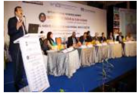
International Business Summit Herbal Health Tourism, North East (India) CLMV (ASEAN) Joint Secy. Min. of Commerce, Govt 24-25 March 2017, Guwahati