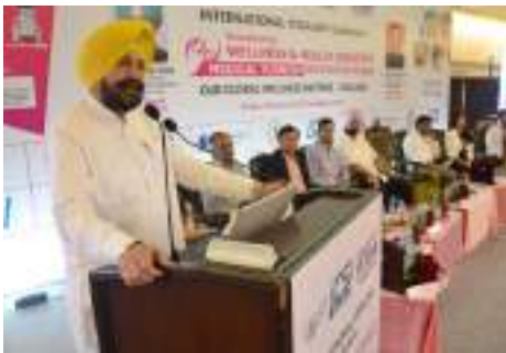
S Balbir Singh Sidhu, Hon'ble Health Minister Punjab 21st June 2019, Chandigarh