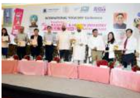
Release of Roadmap by Dignitaries 21st June 2019, Chandigarh